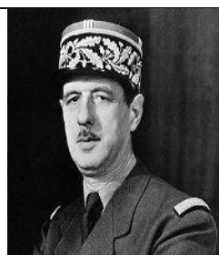
Charles de Gaulle

Pourquoi ces personnes sont-elles connues?