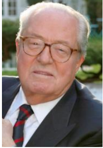
Jean Marie Le Pen