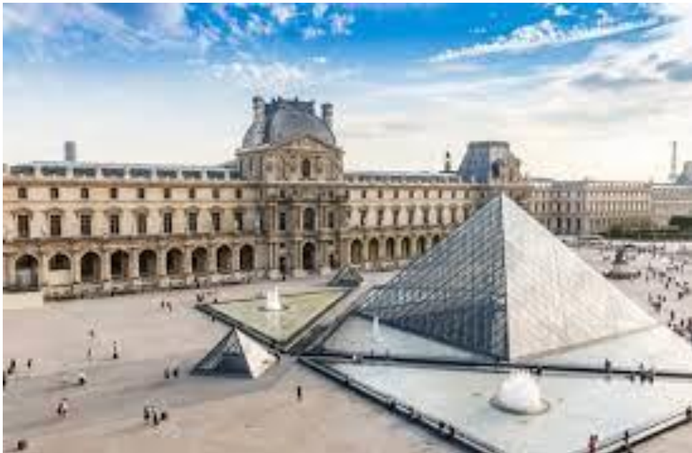
Le Palais du Louvre, Paris