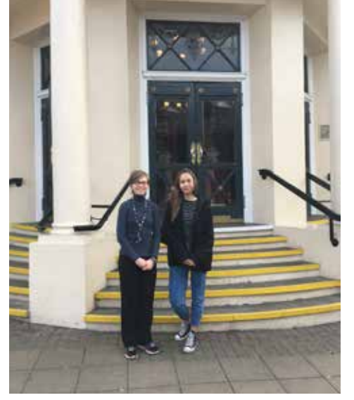
Work Experience at Wimbledon Theatre